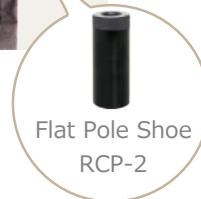
Flat Pole Shoe RCP-2