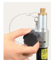
▲ Screw Lock