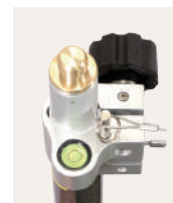
▲ Circular level (Built-in)