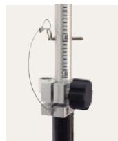
▲ Pin Lock (every 20cm)