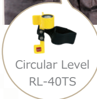
Circular Level RL-40TS