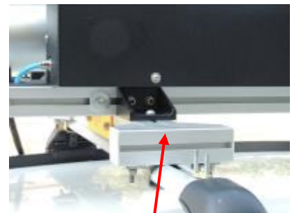
Joints for the bars