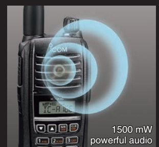
1500 mW powerful audio