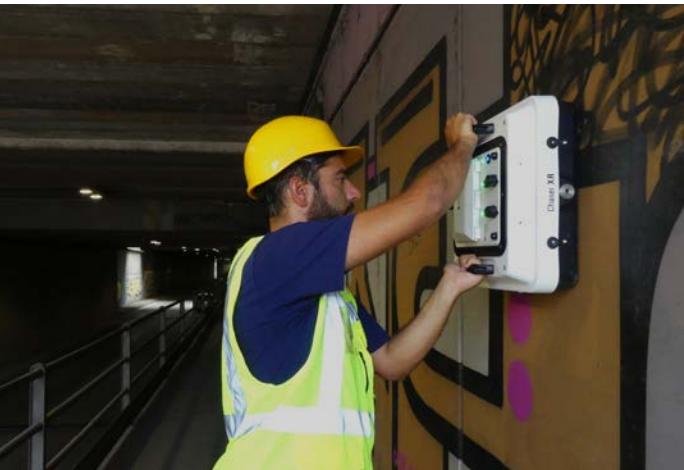
One solution for multiple scenarios: Chaser XR's extended inspection range covers different geophysical surveying applications ranging from environmental assessment to tunnel inspection.