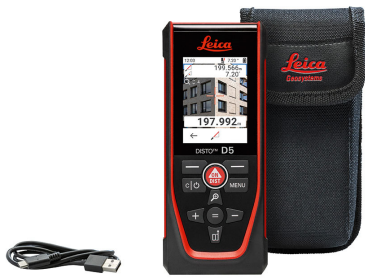
Leica DISTO™ D5 Art. No. 950908

Leica DISTO™ D5, Pouch, USB-C to USB-A Cable, Hand Loop, Quick Start Guide, Warranty card, Safety Manual, Calibration Certificate Silver