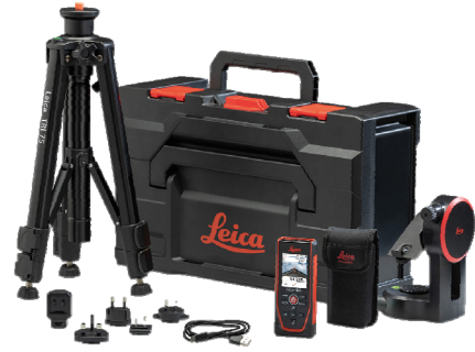
Leica DISTO™ D5 Package Art. No. 950879

Leica DISTO™ D5, Pouch, USB-C to USB-A Cable, Hand Loop, Quick Start Guide, Warranty card, Safety Manual, Calibration Certificate Silver