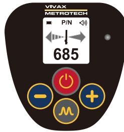
Left/Right cable location